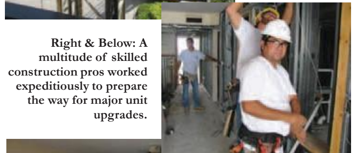
Right & Below: A multitude of skilled construction pros worked expeditiously to prepare the way for major unit upgrades.