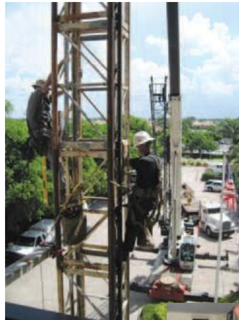
Left: Contractors installed a hoist at the north corner of the Tower, for removal of debris and for bringing in new materials.