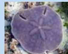
This guy isn't. Leave him (her?) alone.