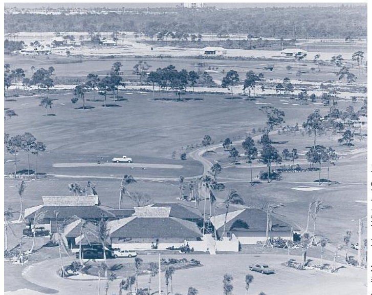
Late 1960s press release photo: Across the lush green fairways of the magnificent Island Country Club, homes designed for resort and leisure living dot the shores of one of the man-made lakes at this new Florida community. Just 100 miles west of Miami, Marco Island is being developed by the Mackle brothers. Perched on the Gulf of Mexico, in the background, is the Emerald Beach condominium, the community's first high-rise apartment building.

A little-known fact about the club is its charitable work. While Gene Sarazen was acting as the honorary pro, the Sarazen Foundation