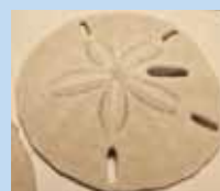
This guy is OK to collect.